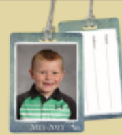
BACKPACK TAG Etiqueta para mochila